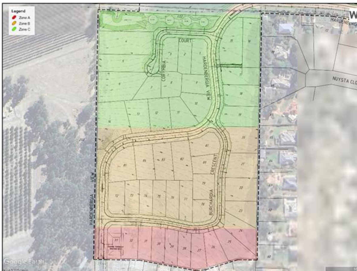
Figure 2: Extract from Drawing 12863-G-D-0002 showing the extents of identified Zones