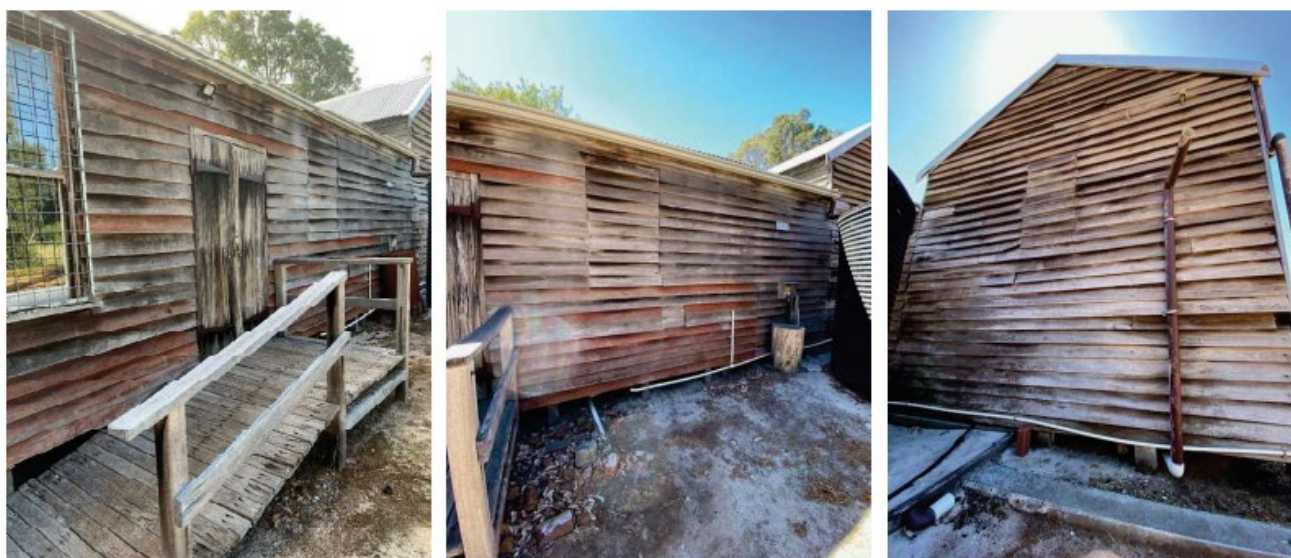
Figure 4 – Rear elevation of Brookhampton Hall