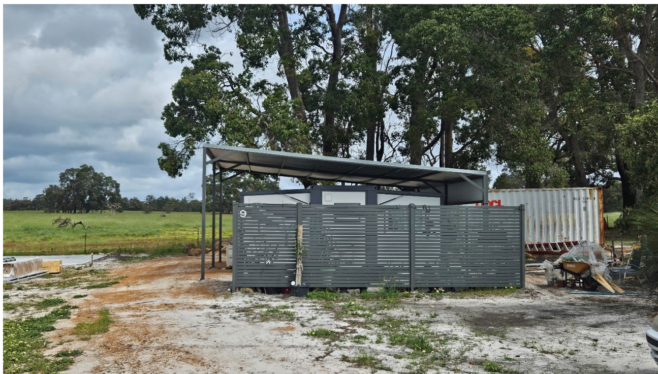
Figure 2 – Street elevation

The current development, while not in keeping with the standard of homes built in the locality, is located within a cul-de-sac i.e. not prominent in the subdivision, setback within the property and presents neatly to the street as illustrated in Figure 2. Works are considered temporary and the landowner is working towards engaging a builder to construct their permanent dwelling.