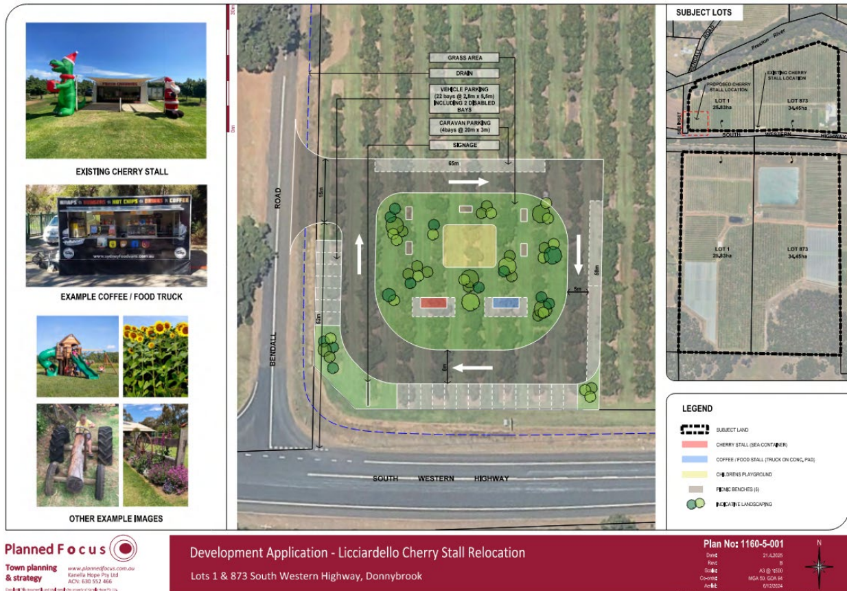
Figure 1 – Development Application Plan