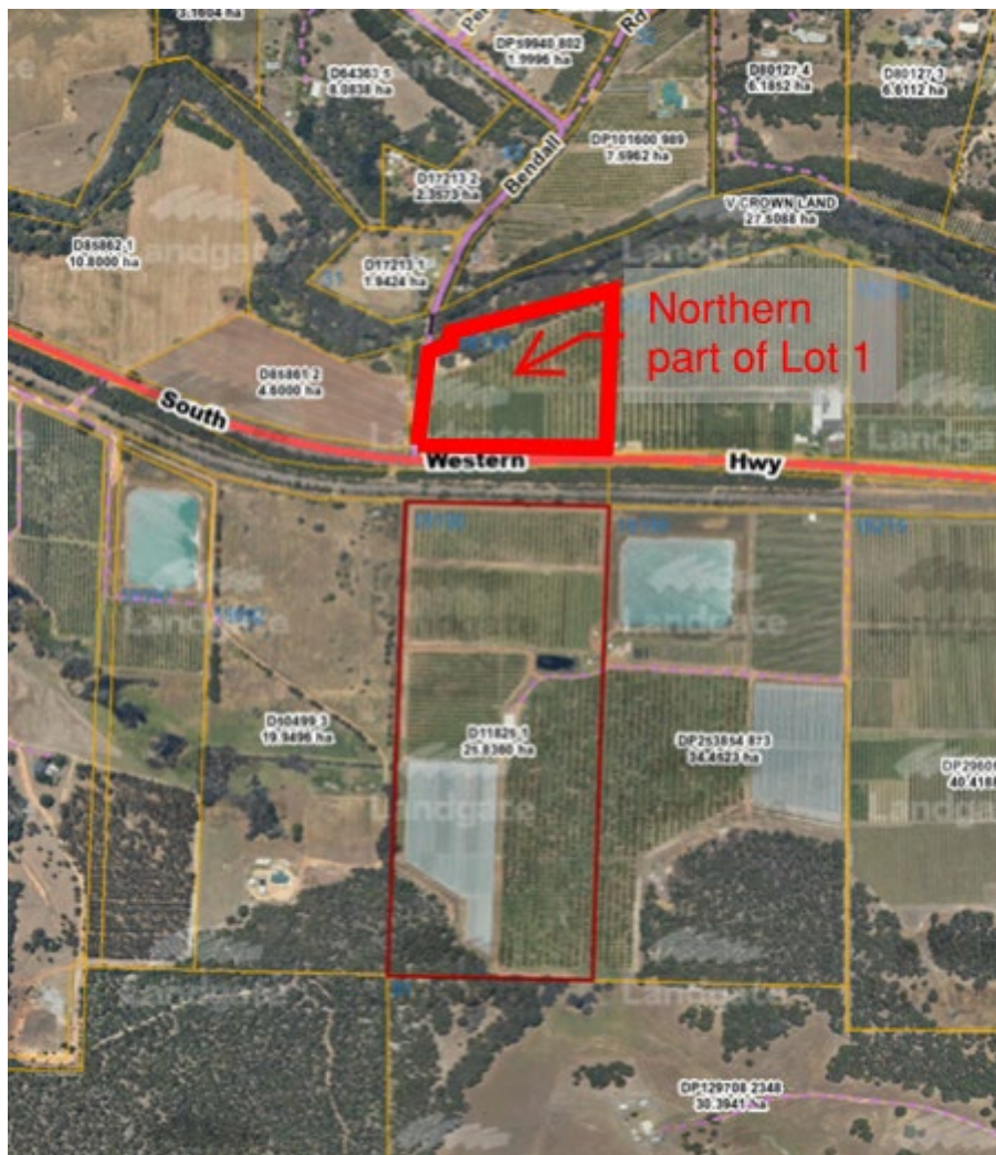
Figure 3 - Lot 1 bordered in red showing surrounding uses.

As previously noted, vehicular access to the site is proposed via Bendall Road, which is a local road under the Shire's control, rather than directly from the South Western Highway.