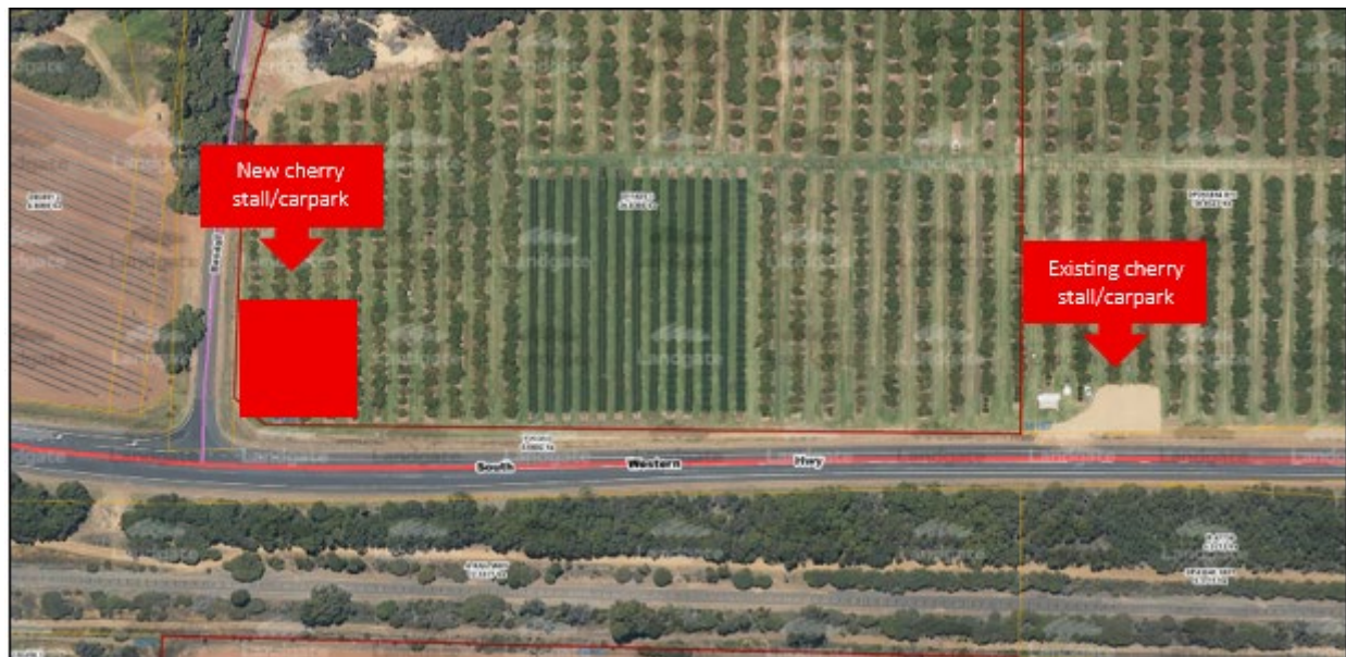
Figure 4 – Showing location of existing cherry stall and proposed relocation at Lot 1.