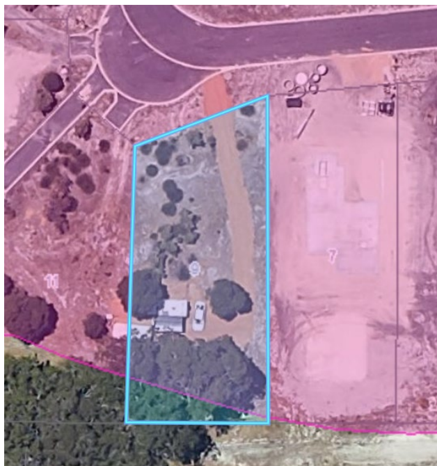
Figure 1 – Excerpt of DFES Map of Bushfire Prone Areas

The land is zoned Residential within the Shire of Donnybrook-Balingup Local Planning Scheme No. 7 (LPS7). As illustrated in Figure 1, the lot, outlined in blue, is designated as bushfire prone. The lot is 1,003m 2 in area.