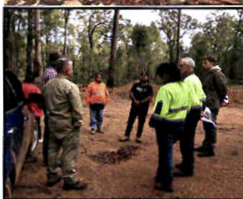
Top: Prickly Pear