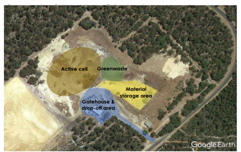
Figure 1: Current Operations, DWMF

In 2016 a Works Approval (Ref: W5577/2013/1) was granted by DWER to construct new cells on the adjoining cleared land, however the approval contained conditions that required the Shire to construct fully lined cells with associated leachate management and other compliance measures. Further assessment revealed that the cost of constructing new cells to DWER's required standards was cost prohibitive for a smaller local government such as the Shire of Donnybrook Balingup.