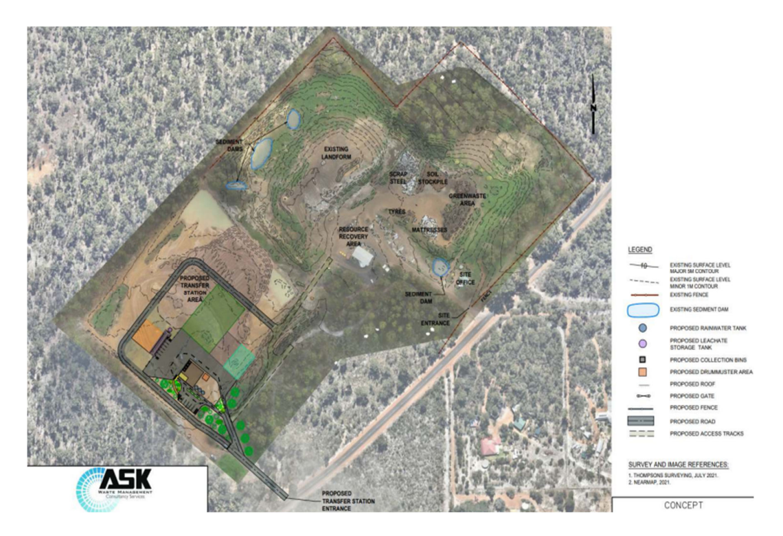
Figure 3: Future Overall Site Layout