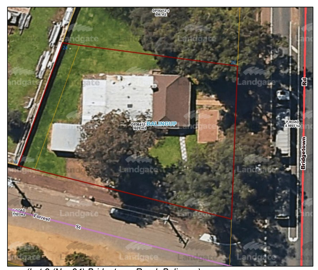
(Lot 2 (No. 24) Bridgetown Road, Balingup)

Lot 2 is 1029m<sup>2</sup> in size and located within the Commercial zoned area along the west side of Bridgetown Road in Balingup and shown in the image below.