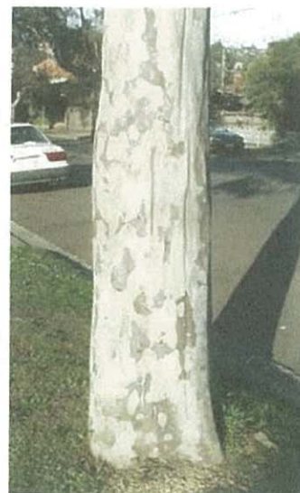
Spotted Gum used in avenue & smooth trunk.